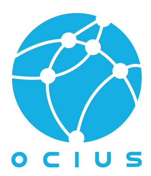
3 Ocius Logo